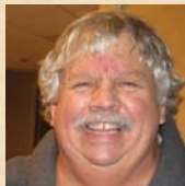
Chip Hearn Ice Cream Store & Peppers