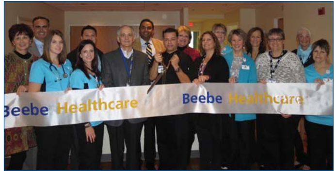
Beebe Healthcare Cardiac Rehab & Ornish Reversal Program