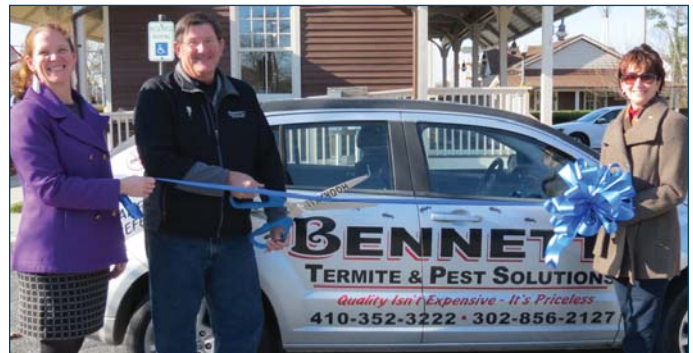
Bennett Termite & Pest Control