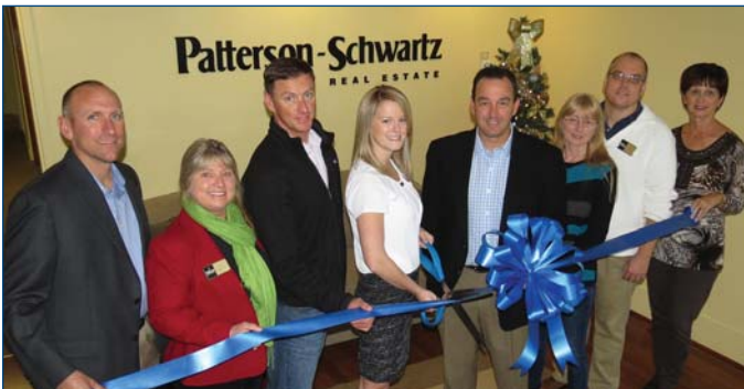
Patterson-Schwartz Real Estate