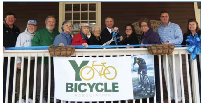
Y Bicycle Association