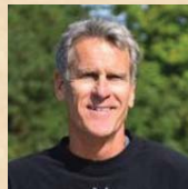
Paul Kuhns Arena's Deli & Summer House